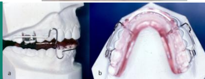
Figure 1: Construction details of SOS Activator